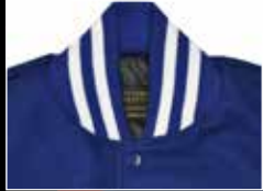
Stand-up Knit Style 7