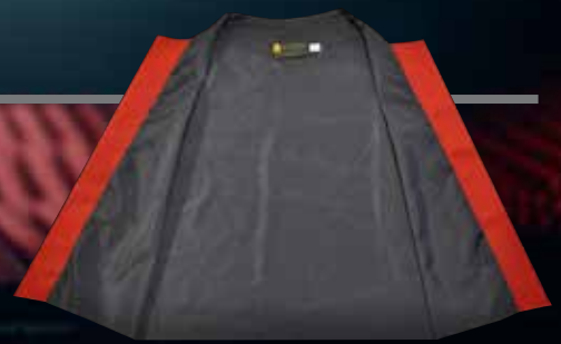
Regular Nylon Lining