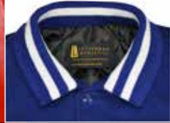
Byron Knit Style 8