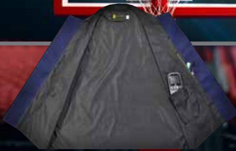
U Access Zippered Nylon Lining

Our Nylon Lining is a light weight lining, available with or without a zipper.