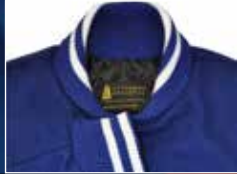
Whiting Knit Style G