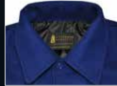
Byron Style 5 All Leather Style 6 All Wool (pictured) Style 15