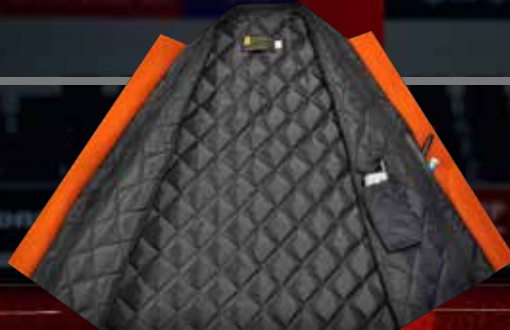
U Access Zippered Quilt Lining

Our Quilt Lining is a heavy weight 5.3 ounce lining, available with or without a zipper.