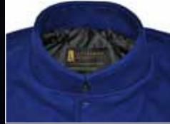
Stand-up Collar Style 12 All Wool (pictured) Style 11 All Leather