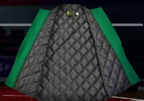
Regular Quilt Lining