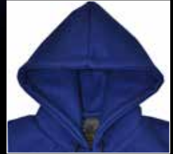
Hoodie Style H

Wool Upside, Leather Downside Style 16 Leather Upside, Wool Downside